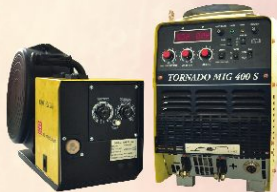
THUNDER-THY MIG 400